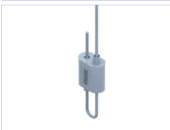
4S standard terminal of the loop type. Universal.