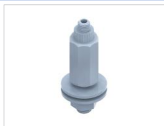
STL8x20 through gripper. M8 thread, multifunctional.