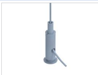
CLM gripper for hanging luminaires.