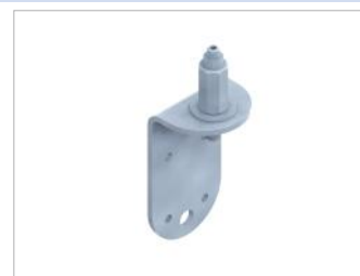
LBO through clamp. HVAC installations.

Depending on our needs, we have a choice of different types of clamps, differing in functionality and load-bearing capacity. What they have in common is quick installation and infinite adjustment. All this means that the wires give us unlimited possibilities for fixing any suspension component. If you do not know which one to choose, please contact us and we will help you find the optimal solution.