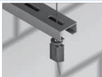
Stopper or loop type KL device. Multifunctional.