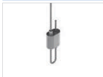
Standard 4S loop device. Universal.