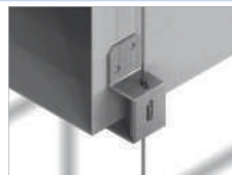
KV100 pass-through device. Reversible.

Depending on the needs, we can choose various types of devices, differing in functionality and load capacity. What they have in common is quick assembly and smooth adjustment. All this makes the wires give us unlimited possibilities of attaching any suspension elements. If you do not know which one to choose, contact us, we will help you choose the optimal solution.