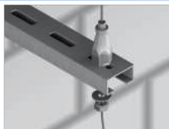
STL 8x20 pass-through device. M8 thread.