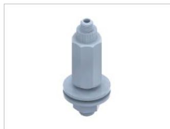
STL8x20 through gripper. M8 thread, multifunctional.