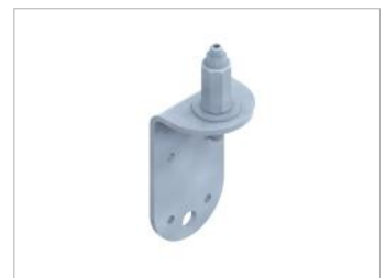
LBO through clamp. HVAC installations.

Depending on our needs, we have a choice of different types of clamps, differing in functionality and load-bearing capacity. What they have in common is quick installation and infinite adjustment. All this means that the wires give us unlimited possibilities for fixing any suspension component. If you do not know which one to choose, please contact us and we will help you find the optimal solution.