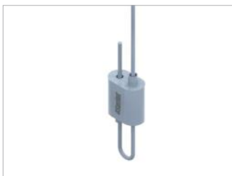
4S standard terminal of the loop type. Universal.