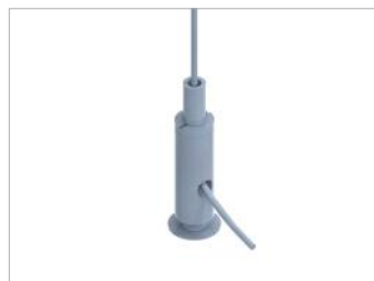
CLM gripper for hanging luminaires.